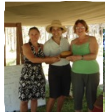
Proudly displaying cake baked in solar cooker